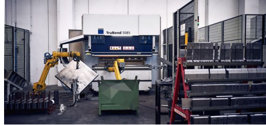
Robot colleague: For the employees at Omas S.p.a., robots have long been part of everyday life.