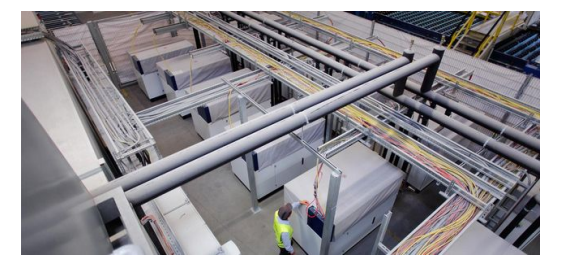
Zwölf Hochleistungslaser erzeugen 144 Kilowatt Leistung.

At the Glasstech 2016 trade fair in Dusseldorf, Saint-Gobain introduced SGG ECLAZ: a new generation of thermally insulating glass for double and triple glazing, which offers not only high light-transmittance values but also 20 percent higher energy efficiency compared to similar glass. A satisfied Lorenzo Canova adds: "Thanks to the new process, we are in a position to create brand-new products."