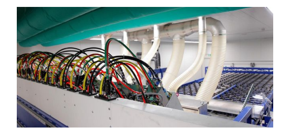
Laserlichtleitungen verbinden die Optiken mit den Lasern.