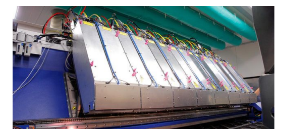
Die Boxen mit den Optiken sind in einer Brücke untergebracht, die die Förderstrecke überspannt.