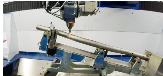
The 3D laser system TruLaser Cell 8030 from TRUMPF can be used to cut out accurate contours, that cannot be inserted before bending because they would otherwise be deformed.