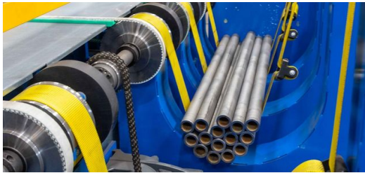
After cutting the tubes on the TruLaser Tube 7000, the tubes are transported to the production network where the robot places them in a bundle space and then distributes them on a table.

During the production of the cross tube for the trailer coupling, the tube process chain now guarantees a smooth process: The TruLaser Tube 7000 fiber cuts the tubes and inserts the contours. The tubes are then transported to the transfluid® tube bending machine and automatically loaded by the robot. After being bent, the robot transfers the components to the TruLaser Cell 8030. This is where the final processing takes place. The 3D laser system cuts out contours that cannot be inserted before bending because they would otherwise be deformed.