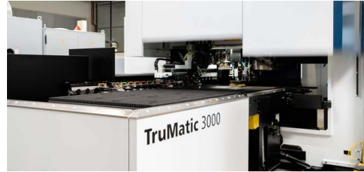
On the TruMatic , hoods shield the processing head, and protective walls on the work table move up if necessary.