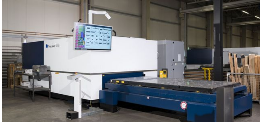
In test operation, the Sorting Guide was installed on a TruLaser 5040 fiber. In the meantime, Tobias Rolf has invested in a new TruLaser 5030 fiber - again with the Sorting Guide, of course.

The Sorting Guide from TRUMPF now makes life a lot easier for these people. In test operation, the camera-based assistance system was initially installed on a TruLaser 5040 fiber machine. The Sorting Guide consists of a high-resolution camera, a large screen and image recognition software. On the screen, the operator sees an image of the sheet on which all the parts that belong together are marked in one color. As soon as he has removed the first part, the camera recognizes which part it is, and the Sorting Guide only shows the parts in color that match the removed part. This provides the operator with a sorting recommendation. In addition, the information about which parts are being removed is sent to the TruTops Fab production control system, where they are marked for posting until the end of the sorting process. Rolf summarizes: "The Sorting Guide is easy to use, reduces the workload of our employees and minimizes the error rate enormously. If I assume a sheet on which several customer orders are placed, the saving in working time from programming to removal preparation to sorting amounts to around one hour per day." In a company that relies on fast turnaround times, that's a big deal.