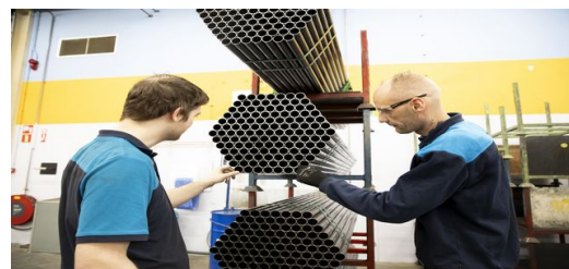
<p>Stainless steel tubes form the basis for the chairs by Ahrend and Gispén. They are usually round, rectangular, or oval. </p>