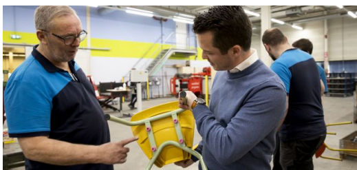
<p>Designed to last throughout a student's school years: Chairs like the Gispén WIZZ chair are sturdy and durable. They also add a touch of color to the school day. </p>