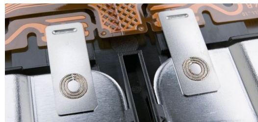
<p>The cell contacting system for electric vehicle battery packs connects the individual battery cells to form a single unit, thereby enabling the transfer of electrical power from the battery to the consumer. The zero-defect strategy applies to the series production of this important component.</p>