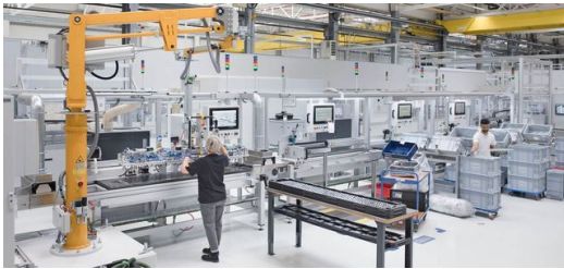
<p>The size of the cell contact system alone is a challenge: it is almost two meters long, but only 20 millimeters thick.</p>

"Just a few training images are enough to create a functional AI model," says Weller. "As soon as the model is satisfactory, we integrate it into the production line and test it on our real component." This is where the new AI filter option for VisionLine Detect comes into play. This filter improves the feature detection of VisionLine Detect and distinguishes even more precisely between relevant image areas and elements such as fixtures, soiling or reflections. "The difference between VisionLine Detect with and without an AI filter is particularly clear here," emphasizes Weller. "The AI filter binarizes the image - i.e. it creates a display in black and white only. The detected component is displayed in white, while the surrounding areas are displayed in black. This allows the edge detection algorithms to easily identify the welding area to be detected."