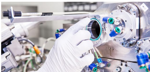
A mechatronics engineer installs a mirror mounting.

Which brings us back to the laser; the idea behind the laserbased fabrication process can be expressed fairly simply. Basically, a tin generator fires 50,000 droplets of tin a second (!) through a vacuum chamber and a laser pulse strikes the droplets as they shoot past. This is a kind of high-tech version of clay target shooting – and it generates a plasma in the vacuum that emits EUV light at the desired wavelength of 13.5 nanometers. A collector gathers up the EUV light and delivers it to the lithography system to expose the wafer. To produce the laser pulses, TRUMPF developed a one-of-a-kind beam source based on its CO 2 laser technology – the TRUMPF laser amplifier. In five amplifier stages, this device boosts a weak laser pulse more than 10,000 times, outputting more than 30 kilowatts of mean pulse power. Pulse peak power can be as high as several megawatts.