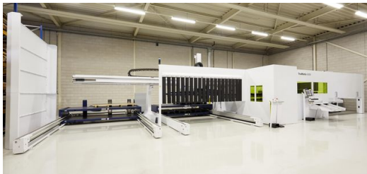
“Automating our machines eases the work for the employees. Instead of tedious and troublesome loading and unloading operations, they can devote their attention to other tasks during production operations,” Sander Mutsaers explains.

“Even after this short period in use we have been able to reduce by 40 percent the time needed to manufacture the front panel of a pay-and-display machine, made of aluminum and stainless steel. The separate working phase at the press brake for small bendings is eliminated because the new punch laser cutting machine already takes care of the necessary bends,” he tells us. Formed areas – like brackets, threads and hinges – are now made up quickly and easily on the TruMatic 6000 fiber. Four TRUMPF press brakes are used when processing larger parts and assemblies.