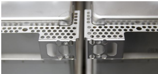
Formed areas – like brackets, threads and hinges – are now made up quickly and easily on the TruMatic 6000 fiber.