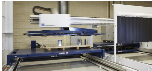
The SheetMaster is entrusted with loading and unloading the machine. It sorts the parts and lays them on the cart or pallet.