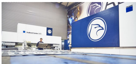
Most up-to-date technologies: Worker with the TruBend Center 5030