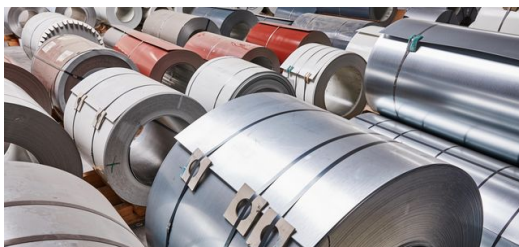
To ensure his company can supply all customers within 48 hours, Wagner maintains a well-stocked warehouse. Apart from sheet steel between 0.75 and five millimeters in thickness, the company also processes galvanized sheet steel, aluminum, titanium zinc, copper and stainless steel.