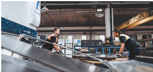
The father and sons decided that they needed a laser cutting machine to close the supply gap and to produce suitable sheet metal parts themselves.

production site, and the company now has a total of 23 TRUMPF machines, from the TruBend 5130 and TruLaser 5030 fiber to the TruLaser Weld 5000 and TruMark Station 7000 . Today, the company employs 170 people and has an annual turnover of 30 million euros. Using TRUMPF machines, Lasercor has cut, bent, engraved and welded parts of all shapes and sizes for some 8,000 customers. Their work ranges from one-off jobs for small businesses to standing orders for major corporations, and their customers make everything from road signs and household appliances to machines, entire plants and large wind turbines. And now that list includes the world-famous Santiago Bernabéu Stadium.