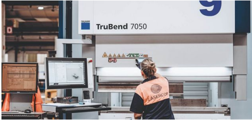
Lasercor has used TRUMPF machines to cut, bend, engrave and weld parts of all kinds for around 8,000 customers.