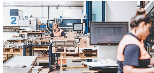
Getting everyone involved: Every part of the Spanish company was involved in the stadium project.