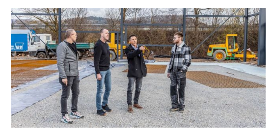
DELO is planning on relocating to neighboring Hechingen in September 2023. Construction work is in full swing. With a developed area of 2,000