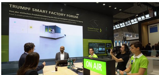
From consulting services to automation to fully digitally networked production - four TRUMPF experts answer questions from moderator Chris Brow.