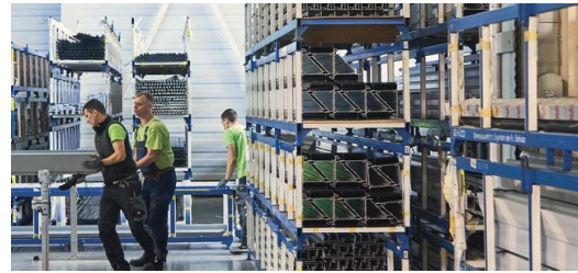
New solutions: to provide its custom facade solutions, KFK has to constantly think one step ahead and remain flexible at all times.