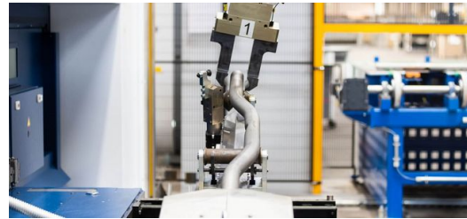
The systems in the machine network are automated by a robot system, which automatically transports the parts from one processing step to the next.