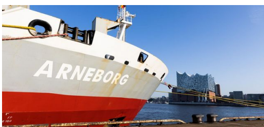
The container ship is scheduled to arrive in New York in about two weeks.