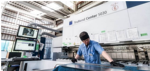
An employee working with the TruBend Center 5030 : This is how the "Orisu" chair is made.