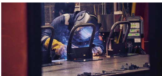
Hutchinson Engineering employs 100 people making products for customers from a variety of sectors ranging from bus manufacturers to the aviation industry.