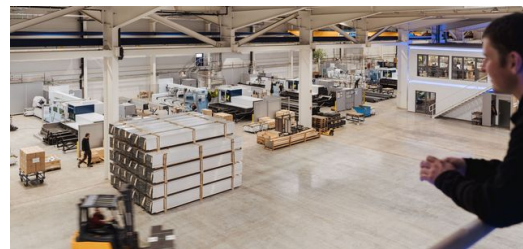
<p><strong>Chicago sends its regards: </strong> Based on the example of the TRUMPF Smart Factory, Peter Götzl has built a fully automated sheet metal processing facility in Erbdorf.</p>