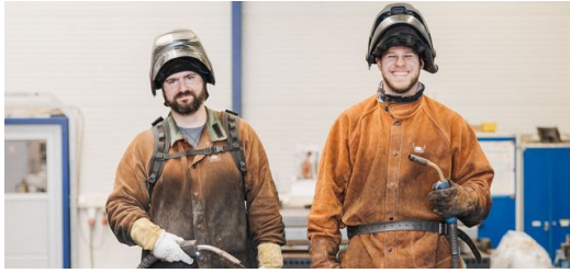
Busy times in the high-tech store: Some things are still completed by hand by production employees, well protected in their welder's gear.