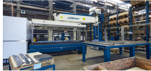
A Stopa storage system takes care of supplying materials while a LiftMaster makes it easier to handle parts.