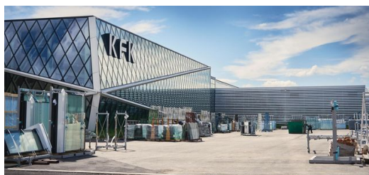
The KFK building in Croatia.

KFK used to focus predominantly on customers from Croatia, but today the company is involved in projects all over the world. “Right now we’re focusing on the UK, which is currently experiencing a boom in construction. All the world’s big cities are constantly striving to make buildings that are taller, more sophisticated and even better quality, and London is no exception,” says Papac. He is particularly proud of the biggest project KFK is working on at the moment: “It’s a residential building in London, the tallest structure of its kind currently under construction anywhere in Europe. With 76 floors and at 233 meters tall, it’s a project that obviously requires the production of lots and lots of facade modules.” It takes several years to complete projects on this scale – three and a half years in this case.