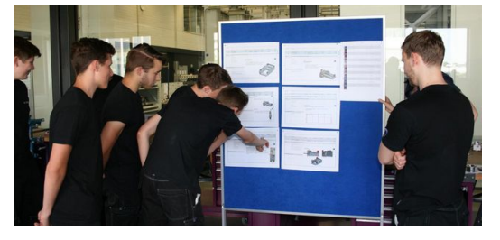
That 's why the training department want s to move with the times by using the methodologies that currently have priority within the company and are in widespread use.