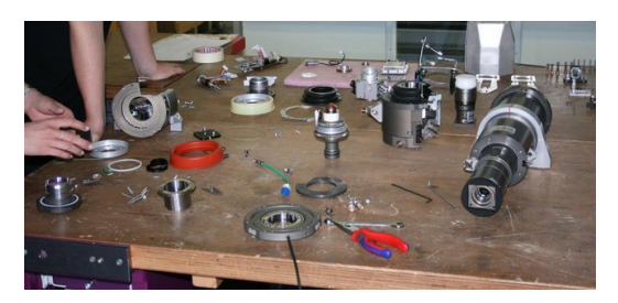
With some people spending periods of time at vocational colleges and following the dual study system, the challenge is that you don't have all the participants in the same place at the same time. On top of that, not all the apprentices on the technical side of things have access to their own computer.