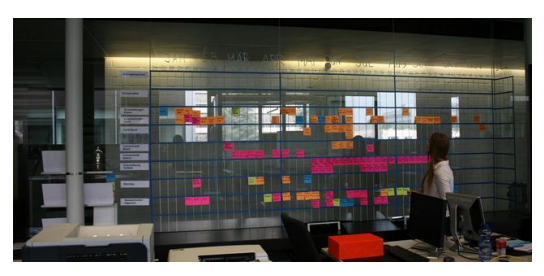
The traditional kinds of project-management methods that require a computer didn't provide proper transparency to each and every individual.

definitely expected to step up and say what the next steps will be.