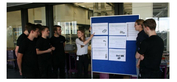
The idea is to actively involve 170 students and apprentices from different departments in the project over the next three years, and to accompany them on that journey.