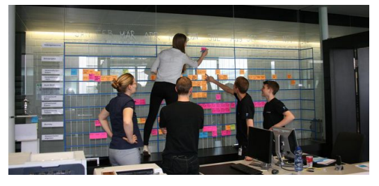
But by using pinboards and workshop boards , the team keeps all the individuals tages and process visible at all times , so everyone is kept up to date on the current status.