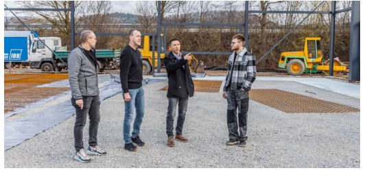
DELO is planning on relocating to neighboring Hechingen in September 2023. Construction work is in full swing. With a developed area of 2,000