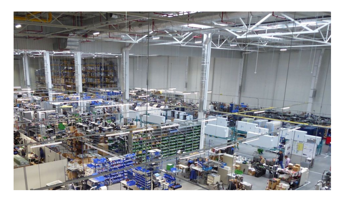
The Ukrainian employees work in production in Marki. TRUMPF Hüttinger manufactures modules for control cabinets there.