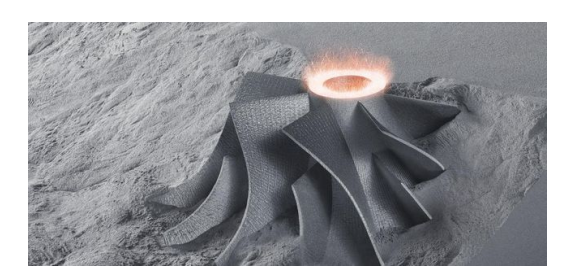
3D printing will become an important new manufacturing method leading to massive cost saving.