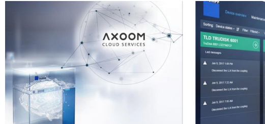
Some of the data is uploaded to the AXOOM Cloud via the Internet.