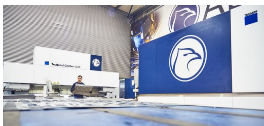
Most up-to-date technologies: Worker with the TruBend Center 5030