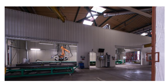
Photon AG manufactures rail car side walls up to 25 meters long in its laser cabin.

"The big challenge of this project was to find a time-optimized automation method for producing the outer skin segments," says Alder. Photon came up with the idea of producing the segments in two laser cabins that can be loaded from two sides. Each cabin contains a robot that welds the sheet metal parts together and attaches them to the longitudinal and transverse struts to keep them stable. While one auto- mated fixture is leaving the cabin with its welded assembly on board and the next is taking up position, a TruDisk disk laser is busy feeding the welding robot in the other cabin. This ensures optimum use of the laser at all times.