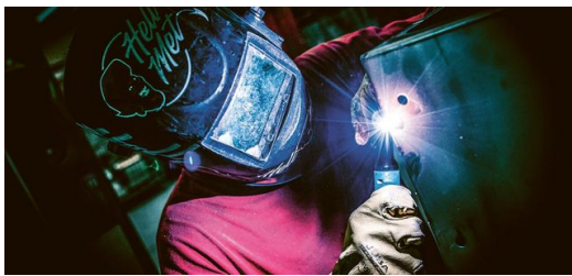
Ripleg offers the complete sheet-metal process chain at its 7,000-square-meter facility. Its portfolio punching and laser cutting, bending, welding, painting and final assembly of products.