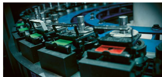
The automated tool changer guarantees top-notch efficiency.