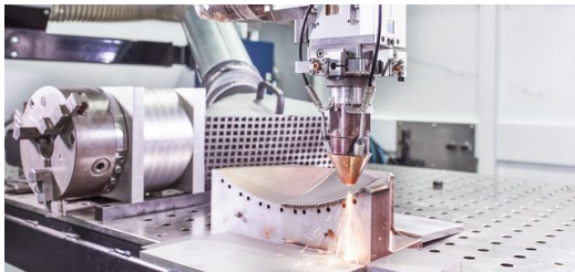
<p>Time to process the order – a TRUMPF laser applies a metal layer onto a tool for a press in the automotive industry.</p>