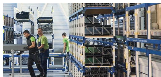
New solutions: to provide its custom facade solutions, KFK has to constantly think one step ahead and remain flexible at all times.