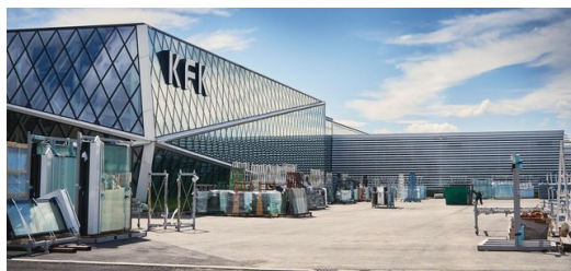
The KFK building in Croatia.