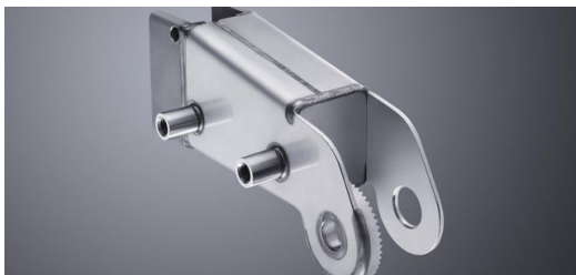
<p> TRUMPF Medizin Systeme setzt in der OP-Tisch-Fertigung auf die Pluspunkte vom Laserschweißen.</p>

This article was first published in May 2014.