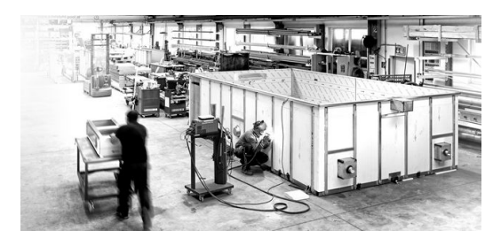
In one piece: Pools with standard dimensions are fully finished at Gassner and transported to the installation site on flatbed trucks.