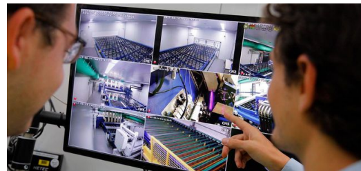
Heating the glass coating very briefly to a high temperature is an essential part of the hardening process. The glass experts at Saint-Gobain spent five years working on their rapid thermal processing method.