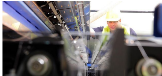
Strahlfallen befinden sich oberhalb und unterhalb der Laserlinie.