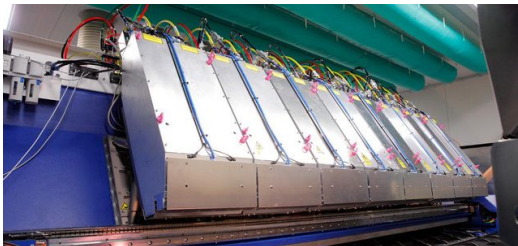
Die Boxen mit den Optiken sind in einer Brücke untergebracht, die die Förderstrecke überspannt.