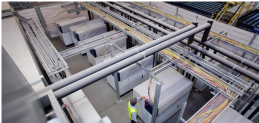
Zwölf Hochleistungslaser erzeugen 144 Kilowatt Leistung.

At the Glasstech 2016 trade fair in Dusseldorf, Saint-Gobain introduced SGG ECLAZ: a new generation of thermally insulating glass for double and triple glazing, which offers not only high light-transmittance values but also 20 percent higher energy efficiency compared to similar glass. A satisfied Lorenzo Canova adds: “Thanks to the new process, we are in a position to create brand-new products.”