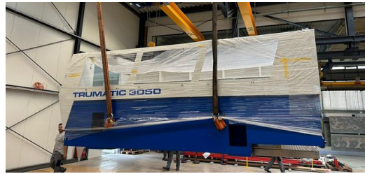
Heavy freight: The seven ton heavy bar arriving at the Matyssek Metalltechnik assembly hall.