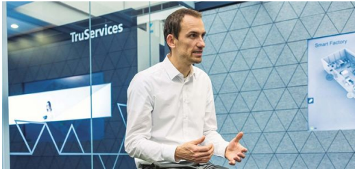
<p>Explaining AI: The TRUMPF computer vision expert is happy to explain how AI can improve sheet-metal cutting. </p>