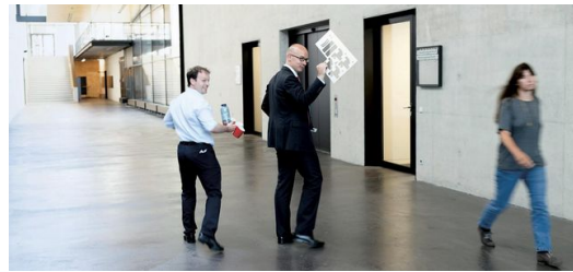
The team of people from the product group, development, purchasing, production, sales, service and project organization departments meets at regular intervals to discuss how development on the TruLaser Center 7030 is progressing.