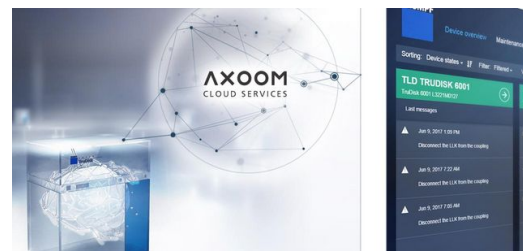
Some of the data is uploaded to the AXOOM Cloud via the Internet.