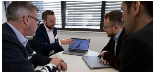
The MultiFocus optics developed by TRUMPF especially for BENTELER produce outstanding results in the pore-free, gas-tight welding of aluminum in combination with BrightLine Weld.