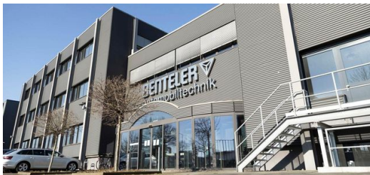
BENTELER is a fourth-generation family business, with headquarters in Paderborn, Germany. In its Automotive Division, this metal process specialist develops, produces and sells safety-relevant products, systems and services for the automotive industry.