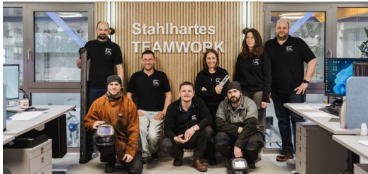
<p><strong>A sense of unity: </strong>Success and quality are ultimately down to one thing – the team.</p>

The courage to expand his business model with new technology has paid off. Götzl now supports other laser tube cutting service providers with large orders and manufactures a wide range of parts, including large series, for example for vehicle swap bodies, high bay storage racks, seating furniture, and solar energy systems. When the first TruLaser Tube 7000 was running at 3-shift operation, he purchased a second one in 2017. And was soon won over not only by the machines, but also by the service provided by TRUMPF.