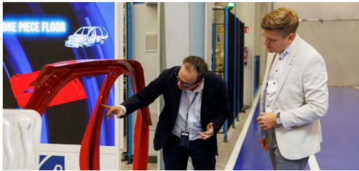
<p>Gestamp processes press-hardened steels with aluminum-silicon coating (AlSi). This protects the component from corrosion, but makes welding challenging.</p>

makes welding rather difficult. It was therefore necessary to replace traditional welding processes with an industrial laser welding process that offers greater speed and flexibility.”