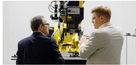
<p>Gestamp has teamed up with TRUMPF to develop an industrial-grade laser welding process for fast and flexible welding of large-format, coated structural parts.</p>