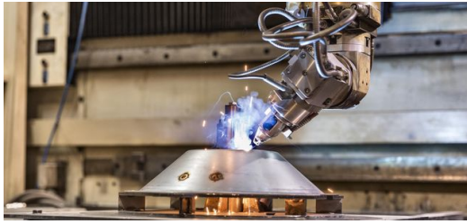
ELFIM uses the Laser cell 1005 for various applications of laser technology such as 2D and 3D cutting or welding and also for laser metal deposition.

perform a 3D scan of an existing replacement part.