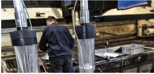
In combination with a powder feeder, the Lasercell 1005 from TRUMPF is also highly suitable for laser metal deposition.

“Strictly speaking, LMD is actually nothing new. It’s a process that has been used for many years now for repairs and coatings. However, we decided to use the process for manufacturing complete components – as is the case with this impeller here.”