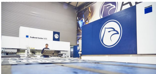
Most up-to-date technologies: Worker with the TruBend Center 5030