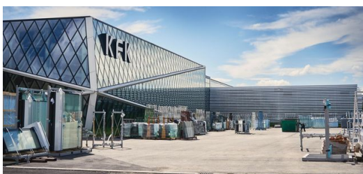
The KFK building in Croatia.