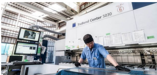
An employee working with the TruBend Center 5030 : This is how the "Orisu" chair is made.