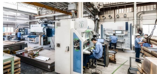
Various TRUMPF machines in KANEYOSHI's production hall ensure efficient manufacturing.