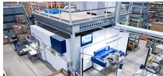
With the TruLaser Weld 5000, CoooolCase cuts the production time for an inverter housing by 2.5 minutes.