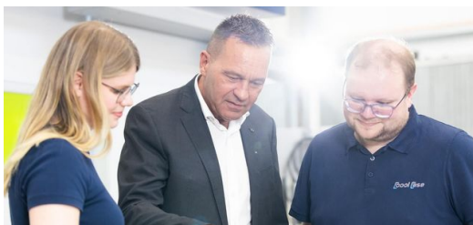
Together with TRUMPF, the two young entrepreneurs from CoolCase are working on the optimum welding processes.

But there is still some way to go before CoolCase can really start welding inverter housings on a large scale. The housing that the customer wants may look unspectacular, but it has a lot to offer in terms of welding technology. CoolCase therefore enlists TRUMPF as a partner to find the optimum parameters and welding strategies. The experts opt for the TruLaser Weld 5000 laser welding system from TRUMPF and start the development phase on the actual customer product.