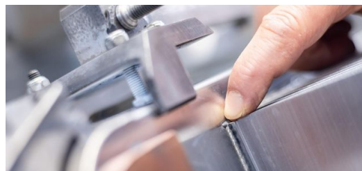
The welded seams of the housing must be completely sealed so that the electronics of the inverter are optimally protected against environmental influences.