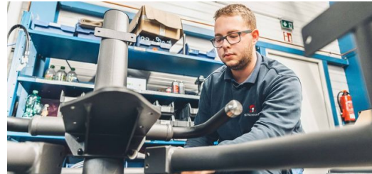
<p>The frame of an EGYM exercise machine consists of primarily oval steel tubes. After processing on a TRUMPF laser tube-cutting machine, it is given an elegant dark gray finish by powder coating.</p>