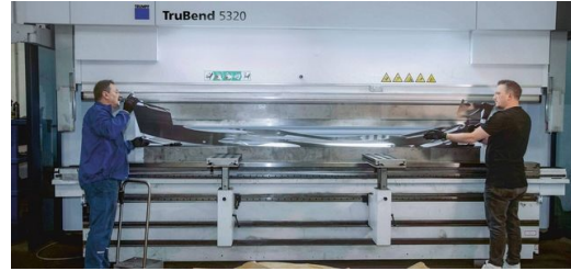
<p>Machine work: Engineers, artists and production workers learn from one another and develop a shared language.</p>