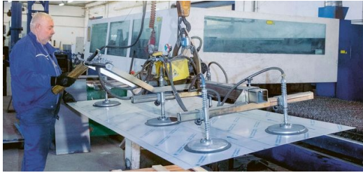
<p>Precision: Crafting artworks isn't a question of speed – it's about pushing the boundaries of what is technically achievable.</p>