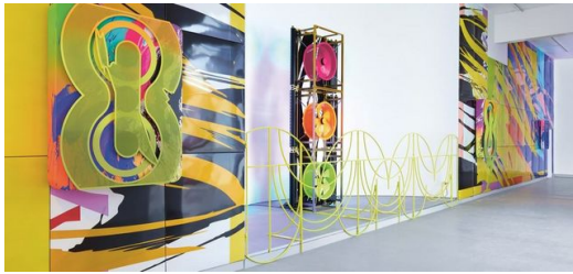
<p>Techno Zen: Superposed and Entangled spans two walls.</p>