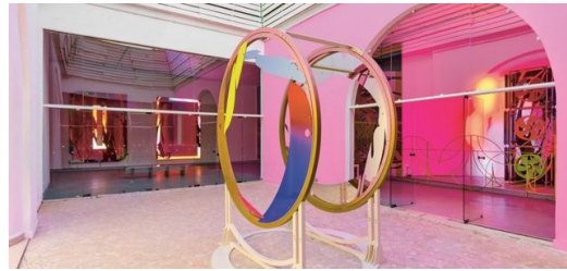
<p>The sculpture Superposed forms the centerpiece of the pavilion.</p>