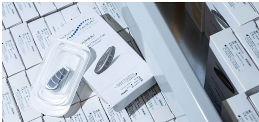
<p>All implants bear the name of an Italian island. In the operating theater, they make it easier for surgeons all over the world to insert them into the spine.</p>

Together with his team, he took a different approach when entering the field of additive manufacturing in 2010, and completely redesigned the parts for 3D printing. "We wanted to make optimal use of the biocompatible and biomechanical properties of titanium," says Caselli. The challenge: titanium is stiff. To achieve elasticity similar to that of human bone, the Tsunami designers worked on the geometry of the spinal cages – and developed them as a mesh structure. This allowed them to achieve a stable base that is also flexible. "The mesh also provides a porous surface that allows the bones to fuse well and quickly," emphasizes the CEO. A study by Cambridge University confirms his statement: after just four to five days, the bone has grown through the mesh. This is significantly faster than with other implants.