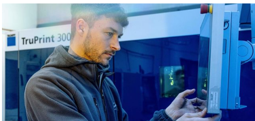
<p>The TruPrint 3000 was the best choice for Tsunami to overcome the challenges of manufacturing titanium implants.</p>

But Caselli's creative team is still tinkering with it, and they are launching the third generation of their spinal cases. Inside, they are integrating a mechanism that fixes the implant directly into the bone. Caselli thinks it's an absolutely ingenious idea. After all, it allows surgeons to attach the implants quickly and easily.